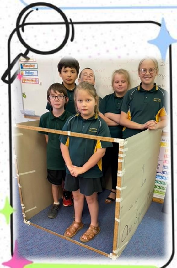
This is the cubic metre we made to measure volume.