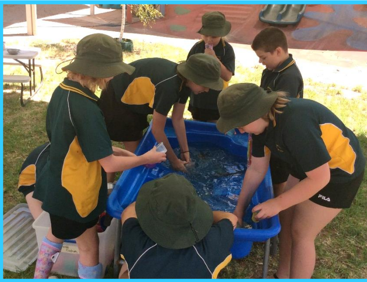
The students loving some water play on these hot days!